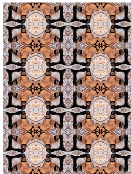
'Sex-mirror # 35' Latex fantasy