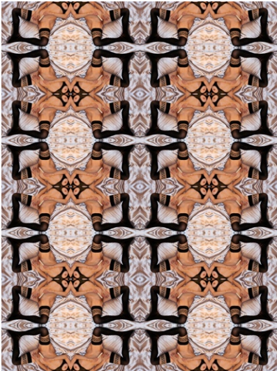
'Sex-mirror #35' ( latex fantasy )